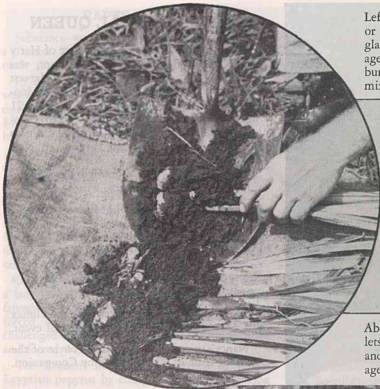
Left: Careful digging with shovel or fork is necessary to protect gladiolus corms (bulbs) from damage. Varieties are kept separate, in burlap or in baskets to prevent mixing.