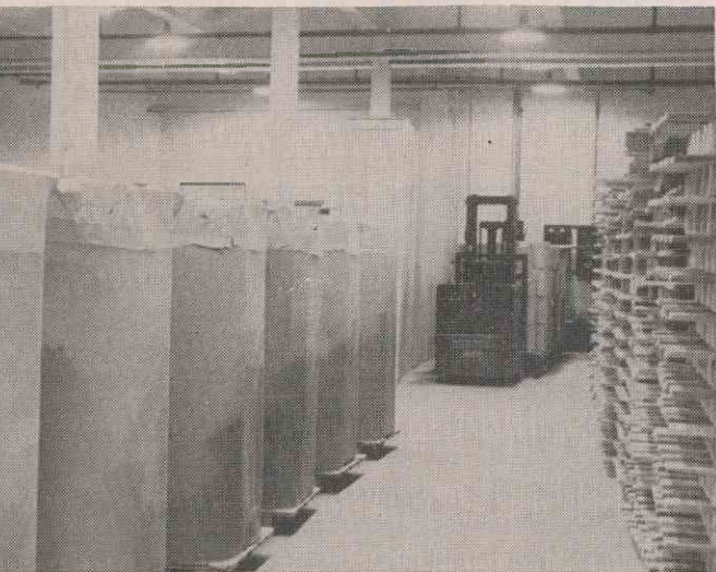
ABOVE: Bobbins of cigarette paper on pallets in the Finishing Department, wrapped and ready for shipment.