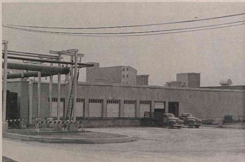
Cellophane shipping area, showing shipping dock located on north end of plant.