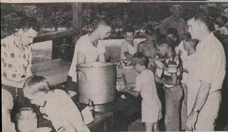
Shown at left is a picture of the fellows enjoying the picnic on the closing day of the school.

"When small boys learn to play together as a team, this teamwork can become a characteristic that will enable them to work in harmony with their fellow-men as adults."