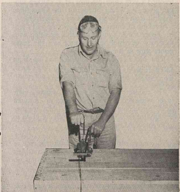
"Smart guys who are goggle-wise, keep them on and protect their eyes". Loss of vision can result in loss of earning power, and our eyesight is so precious that we should never neglect it.

There will never be an acceptable alibi for riding on beds of electric trucks, or on flats being pulled by hand or electric trucks. Saving a few steps in this manner can put one behind the '8' ball and in the hospital.