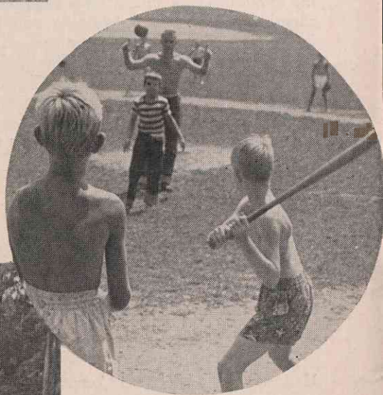
The group of girls shown at right, are a majority of the 84 girls who attended the 1953 session of the Coaching School.