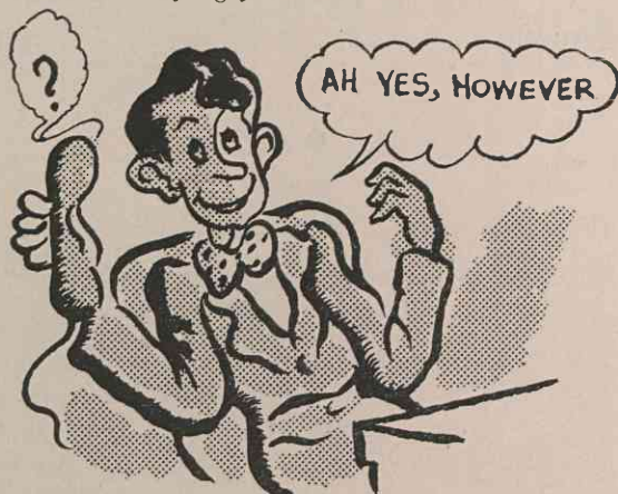
The "mile away" guy

but some do peculiar things with Mr. Bell's invention.