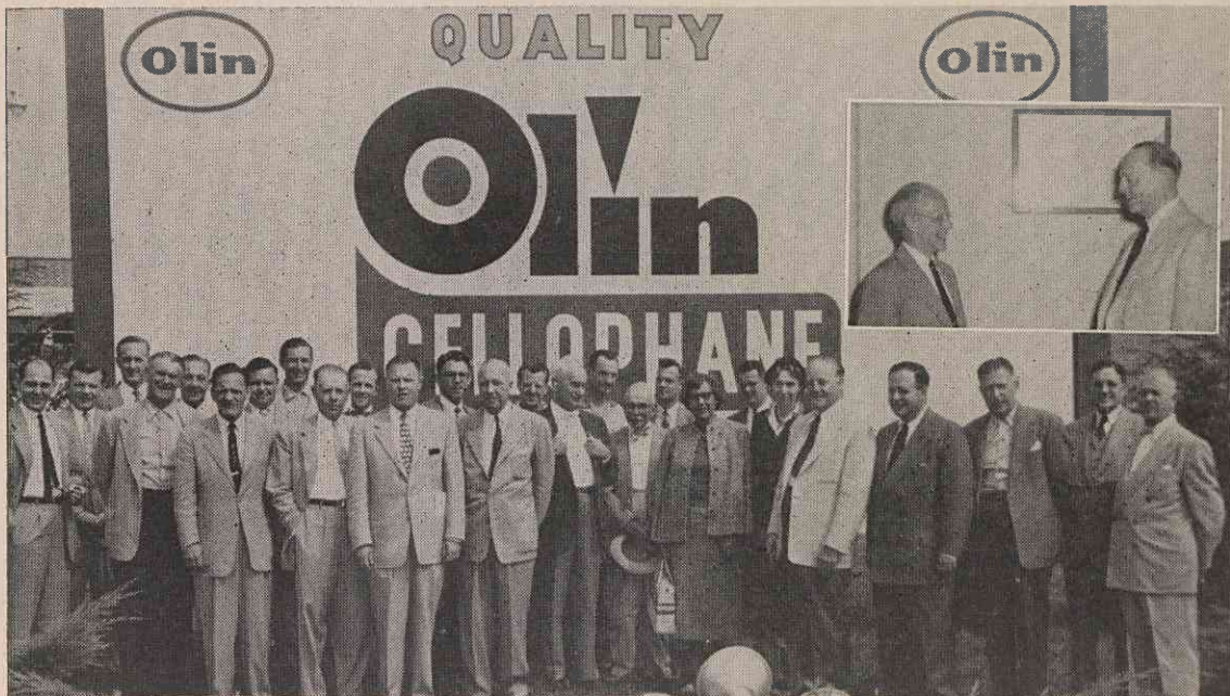
Officers and members of the Packaging Machine Manufacturers Institute visited the Film Division on September 13. The tour of the cellophane plant was part of the program of the organization's