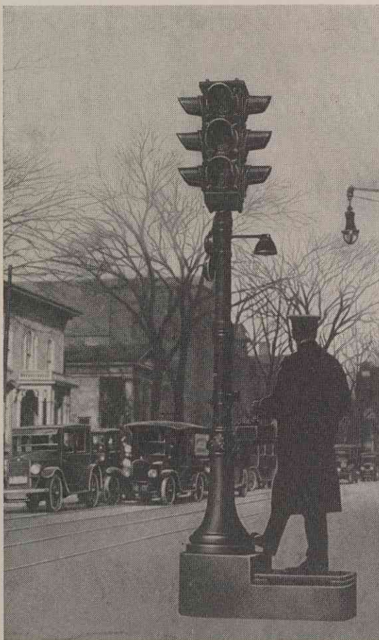
In the passing scene we saw the world's first installation of a 4-way 3-section traffic signal in 1922, Syracuse, New York.

Yet each year, we have seen the careless and the heedless rush by to destruction. Out of the cold record of statistics we have tried each year to recreate the human beings whose last look at the