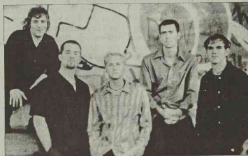
Everything will play April 29 on the quad at UNCA.

Underdog Productions is sponsoring "Kaleidoscope," the all-day event happening on Sat. April 29. The event will take place from 1-11 p.m., and it will include laser tag, a picnic dinner, prizes and several other activities.