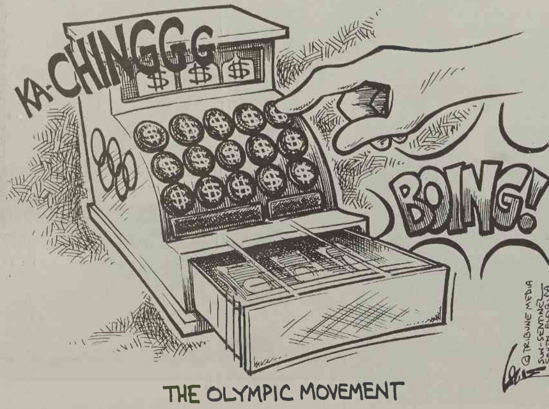
THE OLYMPIC MOVEMENT

Would your campus organization like to run a free classified ad? Call The Blue Banner at 251-6591 or e-mail banner@unca.edu. Ads are due by 5 p.m. on Monday.