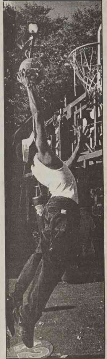
A participant attempts a slam dunk in a Jam Van activity.