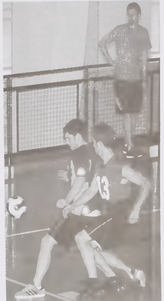
Indoor soccer has seen some tremendous athleticism from the teams that are competing this year all in search for the championship.