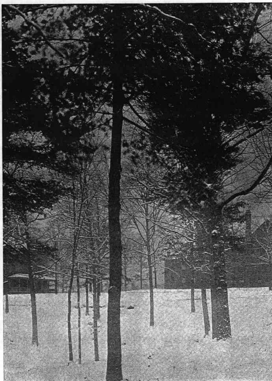
A CAMPUS SCENE IN MID-WINTER