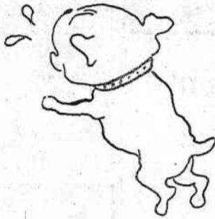
What a Hazer Really Is