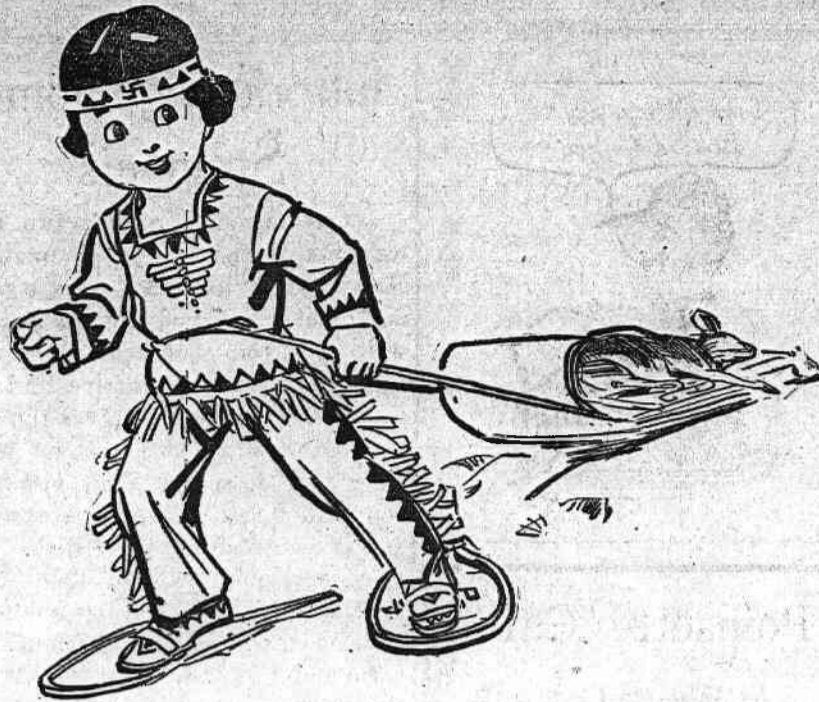
As a Hazer Sees Himself

The backfield is a big problem. It will be light and fast but with new men and less experienced. Due to