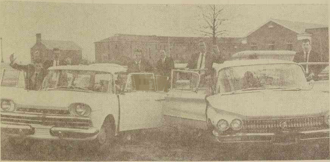
TOURNAMENT BOUND! The Brevard College basketball team, who recently won the Western Carolinas Junior College Conference championship, is shown above prior

The second half found the Bulldogs fighting back as they took a five point lead, as the Tornadoes had difficulty in find-