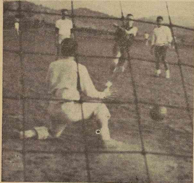
ACTION ON the soccer field is fast and furious in practice sessions.

Brevard ..... 0 0 1—2 Ben Lippen ..... 1 2 3—7