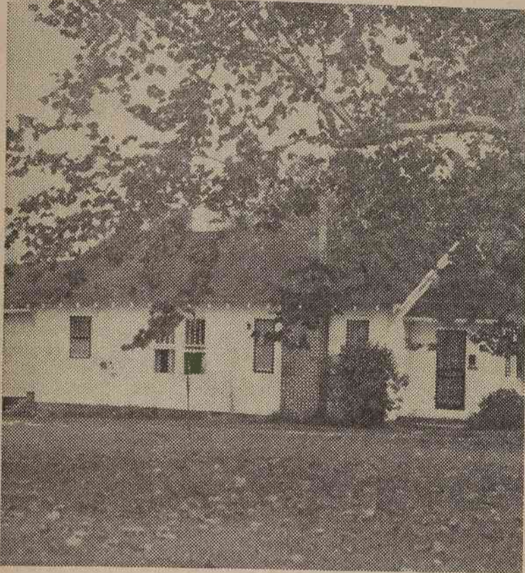
ALL THE COMFORTS of home and a college education too—this is the wealth of the Cantrell House boys. Above is their "home away from home."