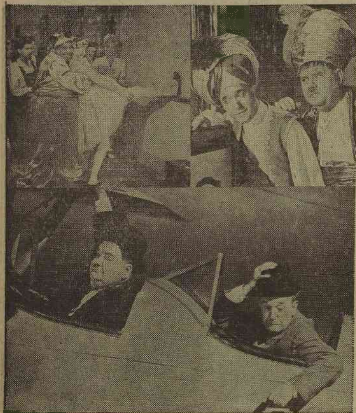
"The Big Noise"