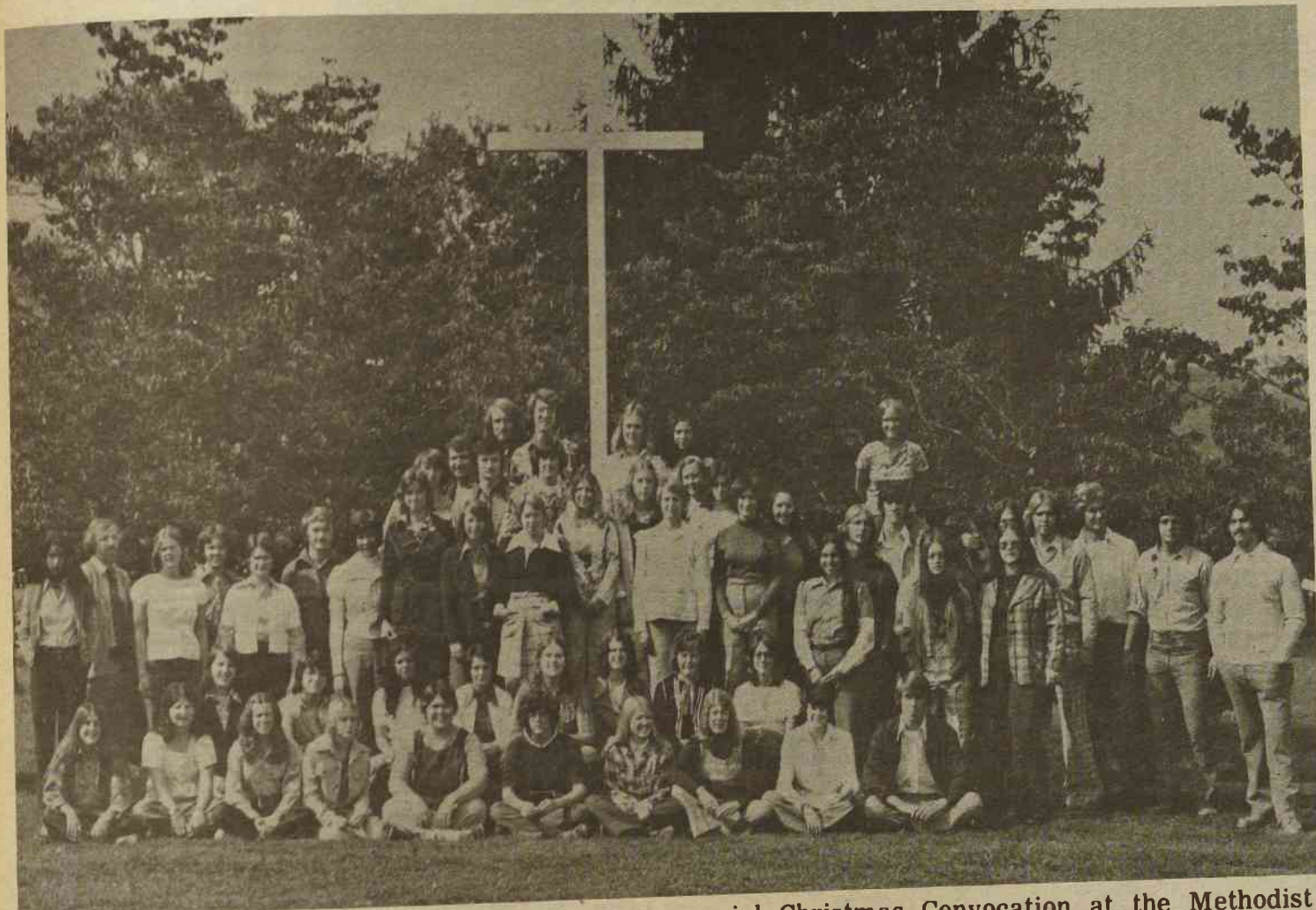
The Glee Club will be featured tonite in a special Christmas Convocation at the Methodist Church.

On December 10 at 7:30 p.m. a special Christmas convocation will be presented by the Brevard College music department at 7:30 in The First United Methodist Church of Brevard. At this time the sanctuary will be transformed into a place of beauty through the practiced music of Brevard College students. It is required that the non-performing students of Brevard College attend this convocation. It is also suggested that students wear formal attire to enhance the traditional atmosphere of this convocation.