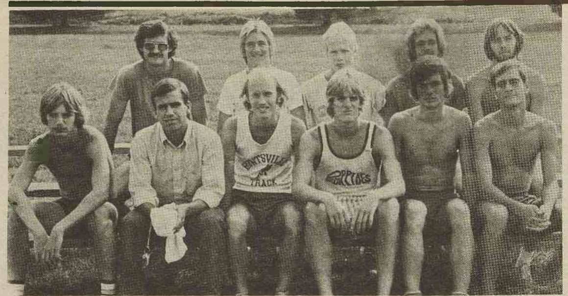
In case you missed them before, here is our undefeated Cross Country team.