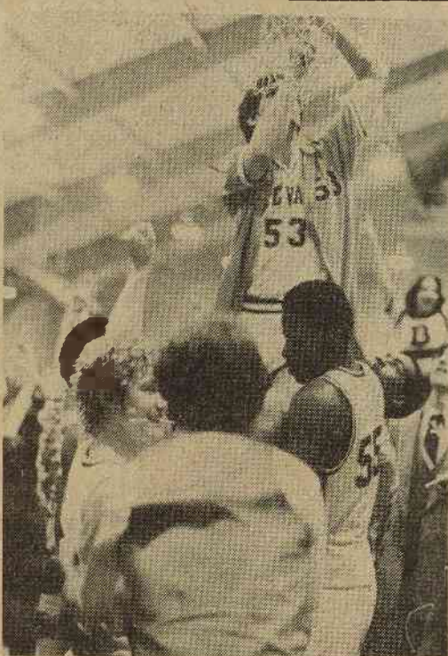
THE B.C. TORNADOS clinched the WCJCC regular season title Thursday night as they defeated Anderson College. See related story on page 4.