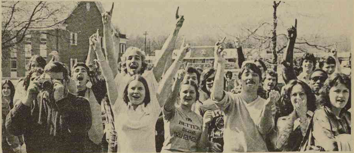
Brevard College Students Are Number One.

So think about this when you register for courses next year and are planning your curriculum - am I presenting the best prepared and most salable self an employer could want? It's up to you.