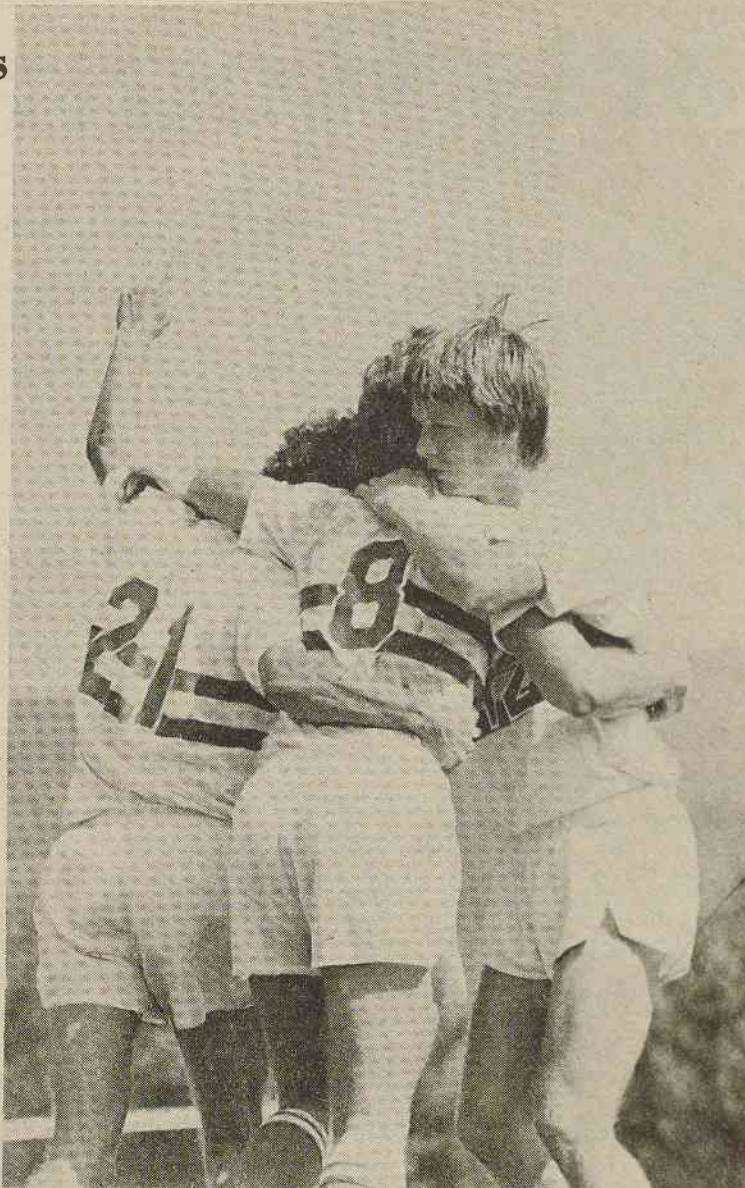
Soccer team celebrates a victory.