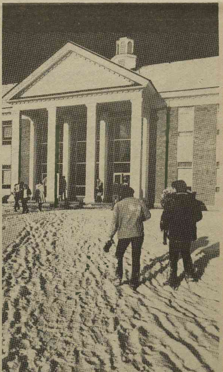
This photo was taken last year at this time. It doesn't seem like Brevard will see snow in March this year.

The singers will "model" their new robes in the Spring Concert, April 2nd.