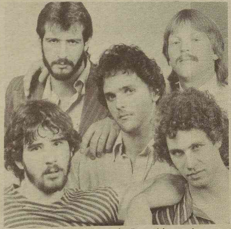
Clear Creek "kicks off" Derby Day with a performance on the Green.

Hot Shandy is one of the most popular campus entertainment groups and has drawn raves from students and all who have heard them. Be sure not to miss this special coffeehouse entertainment treat.