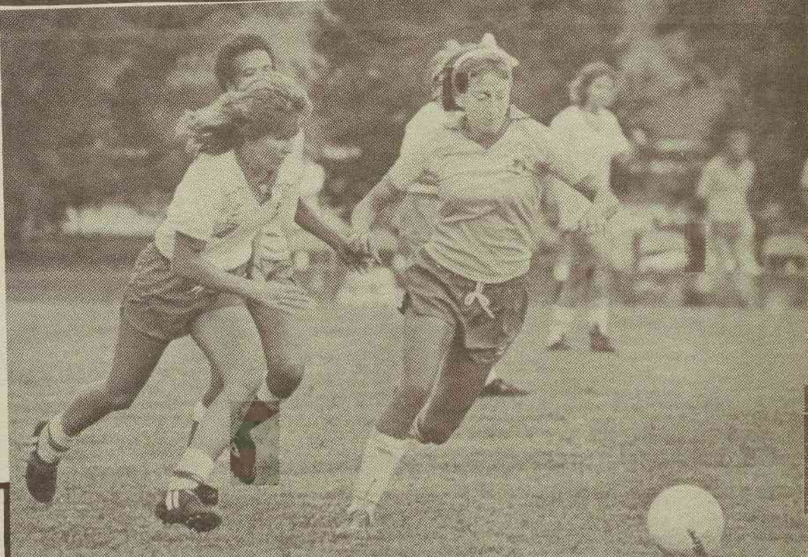
A Lady tornado soccer player makes her move against an opponent from Warren Wilson.