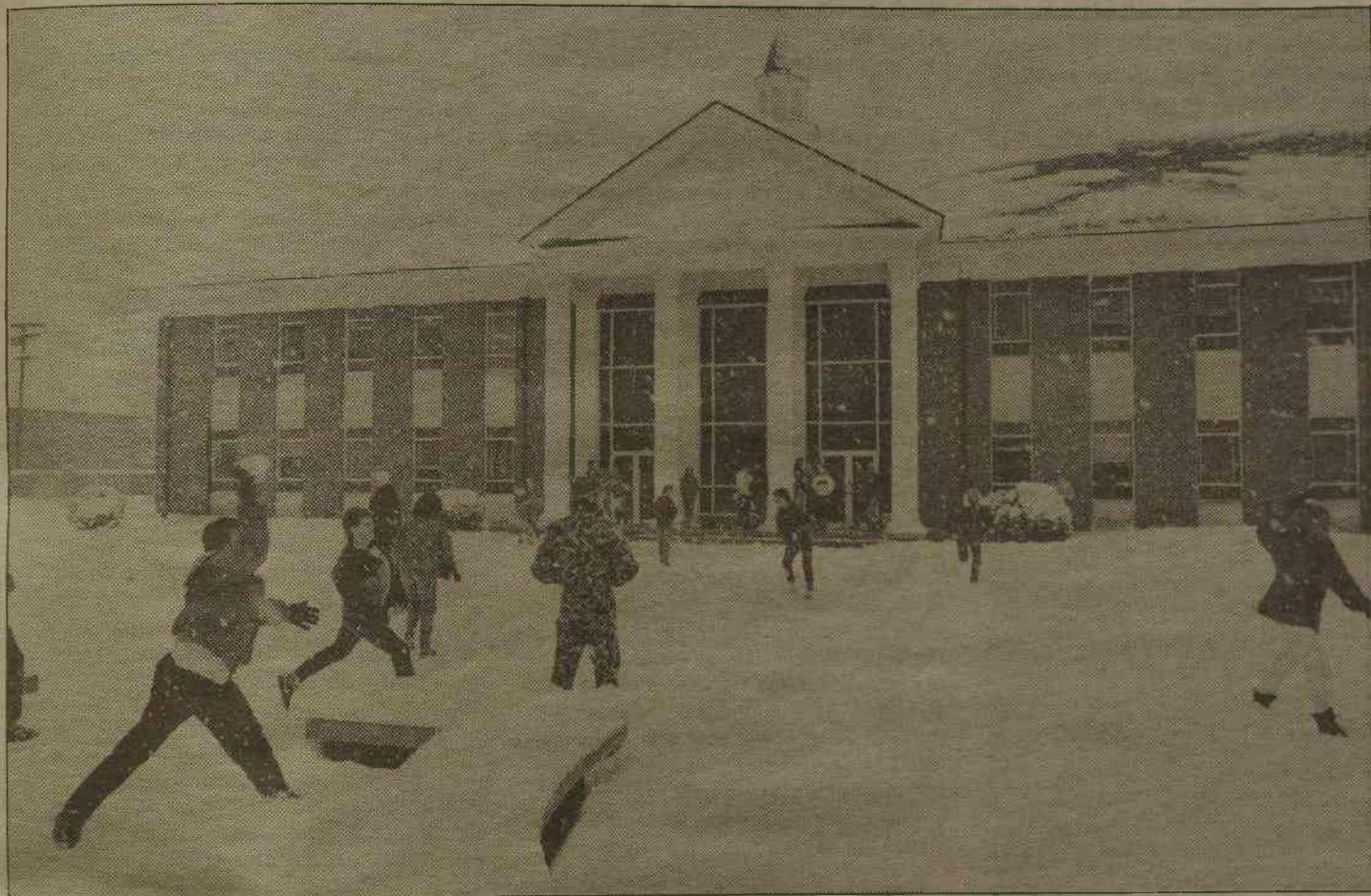
Brevard College was turned into a winter wonderland by two late January snowfalls, making the campus a great place for building snowmen and igloos, going sledding at all hours and having snowball fights on the way to class at McLarty-Goodson. See page 4-5 for more pictures.