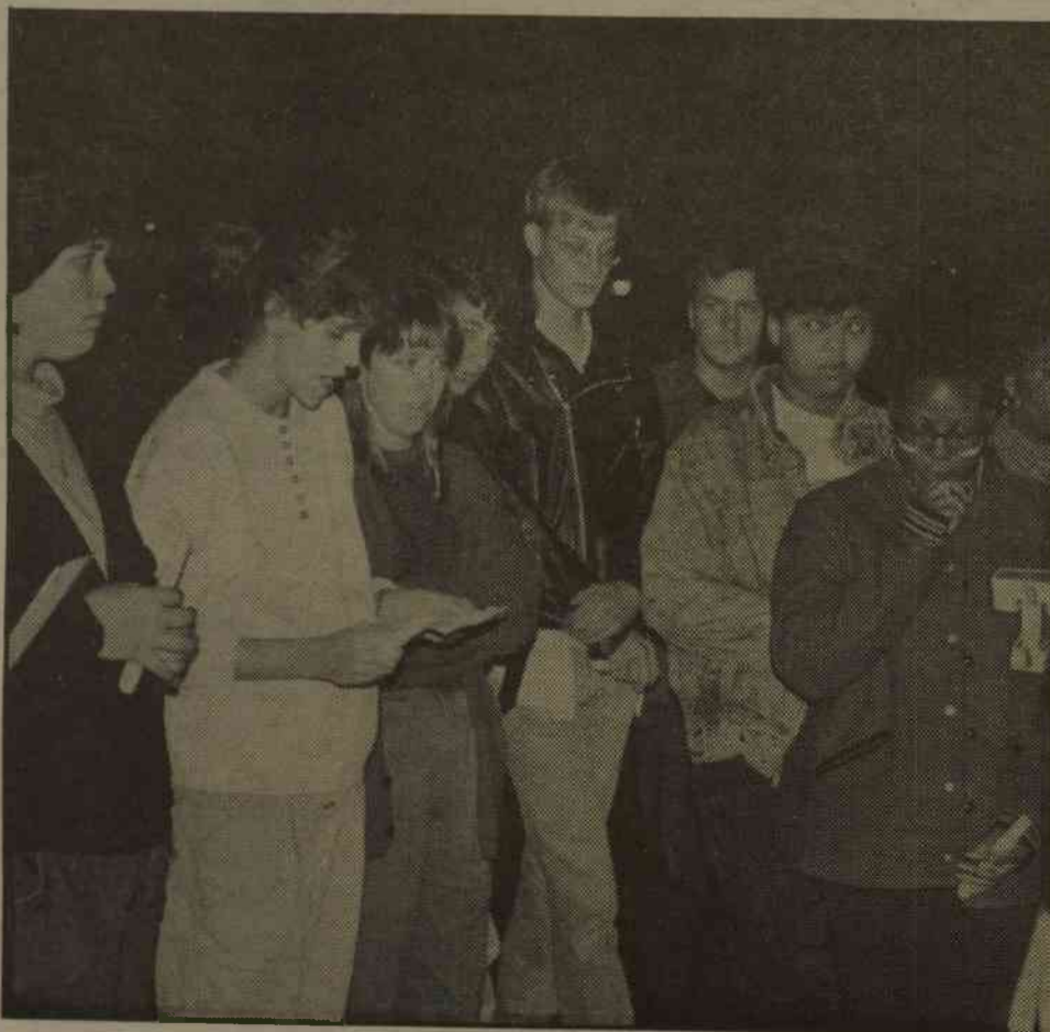
BC students observed Martin Luther King Jr.'s birthday with a Jan. 18 candlelight memorial service at the fountain.