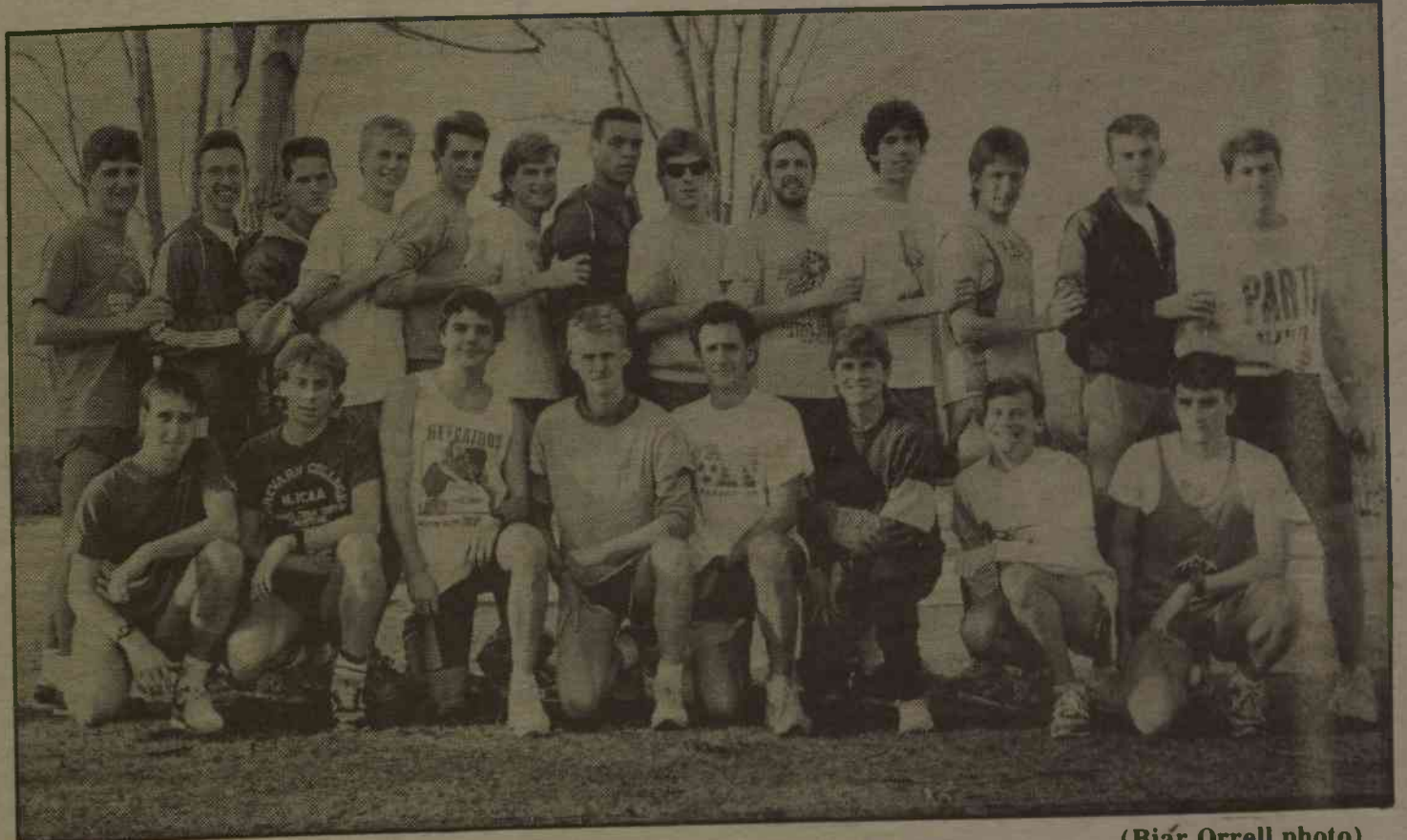
The BC men's indoor track team.