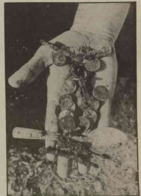
Remember that clogged sewer line in Taylor? Well, this is what BC maintenance men found in there: about a dollar's worth of change, plus keys, nails and eating uten- sils. Talk about throwing money down the drain....

And coming on June 11, is the annual "June Jamm," a week filled with food, fun, and lots of country music, such as Hank Williams, Jr., The Judds, and of course, Alabama.