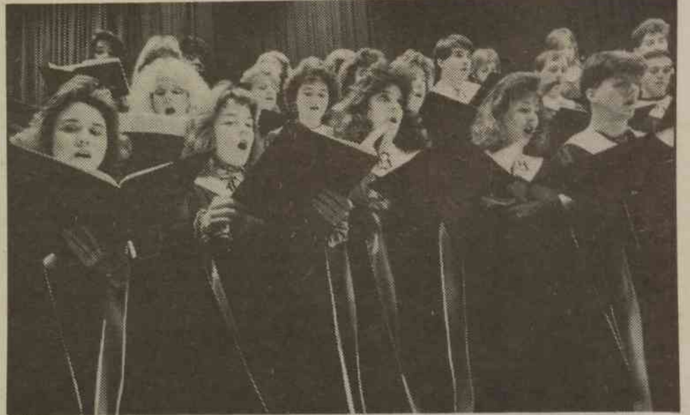
Additional music for the Spring Convocation was provided by the Collegiate Singers...