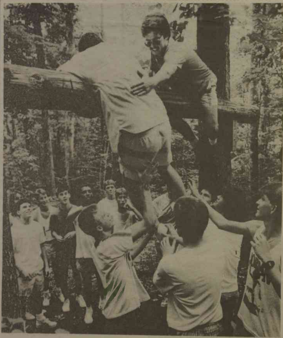
Second floor Taylor men help a teammate over the log at Camp Greenville's challenge course where freshmen learned to work and play together just 24 hours after getting to campus.