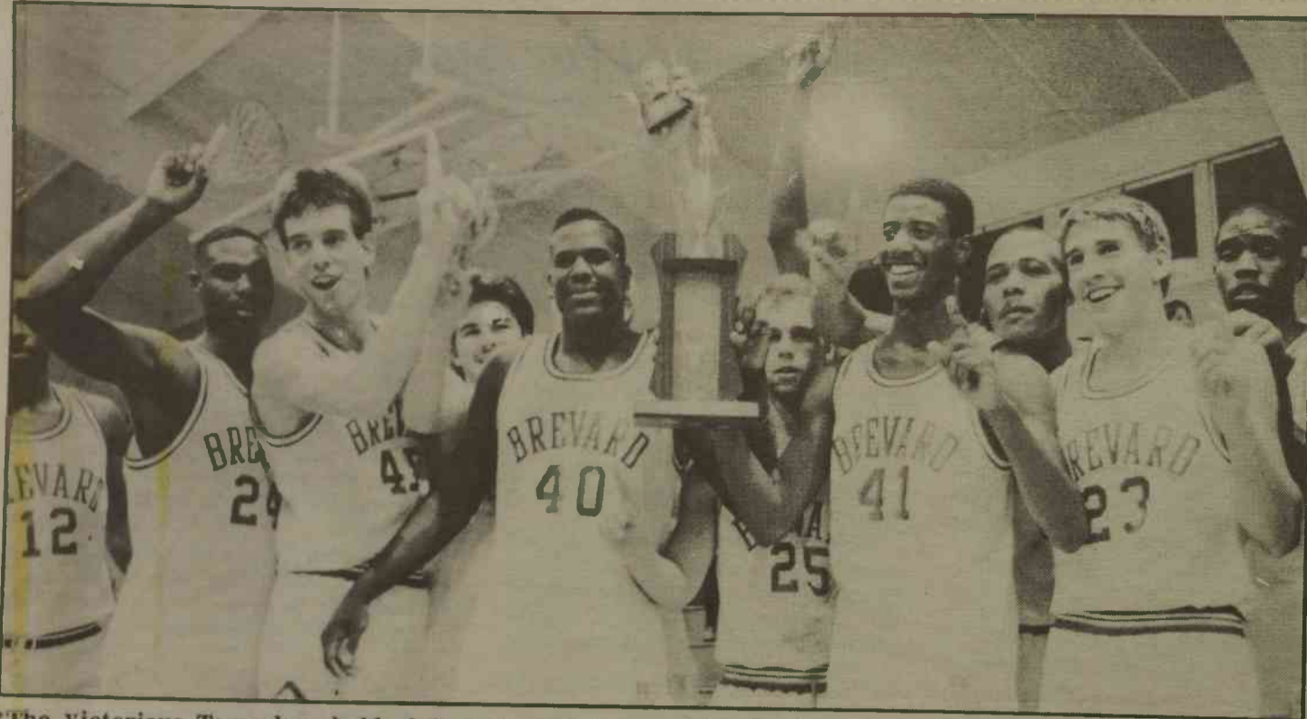
The victorious Tornadoes hold aloft their well-deserved trophy from the Pizza Hut Tip-Off tournament.