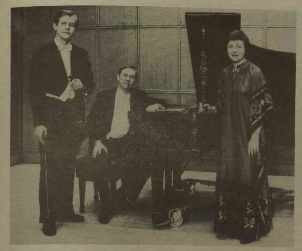
The Verdehr Trio will perform at BC on Thursday, Feb. 23, at 8:15 p.m.