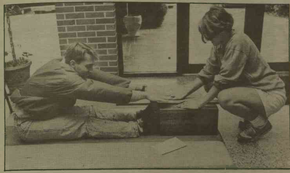
Hundreds of BC students had their blood pressure taken, got their hair trimmed, examined their diets, tried flexibility exercises, measured their height and weight, found out about recycling, eating disorders,