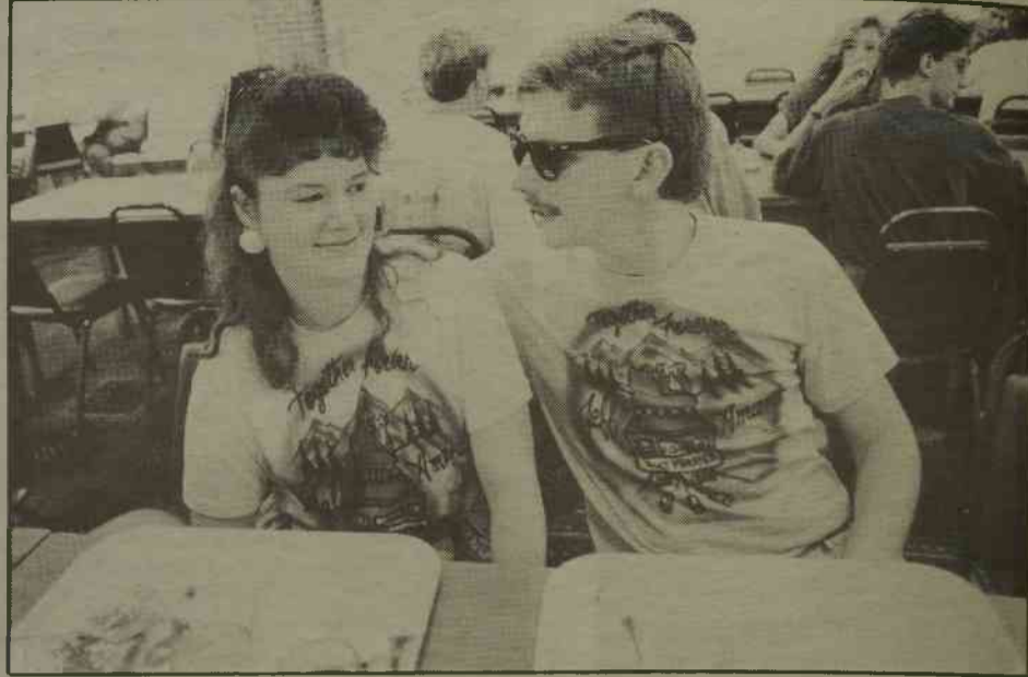
t-shirts and then goes for the Mr. Cool look.