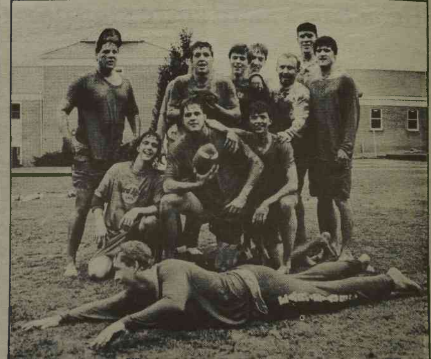
Survivors of the Mud Bowl pose for a group shot.

Last week's mud in front of Jones was just too tempting for this gang of football players, seen here scrambling for a loose ball.