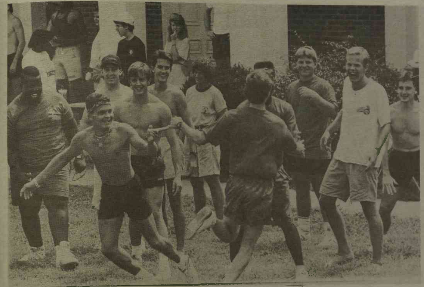
Taylor men laugh it up during their effort in the always-hilarious izzy-dizzy race.