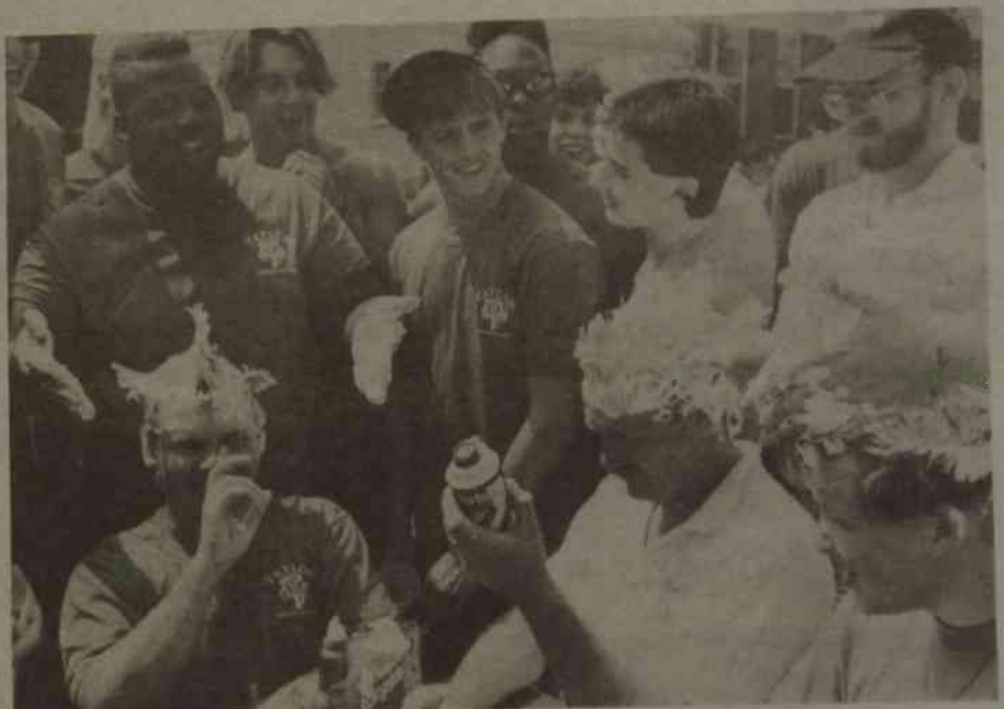
The hair-sculpting contest produces fantastic 'dos.