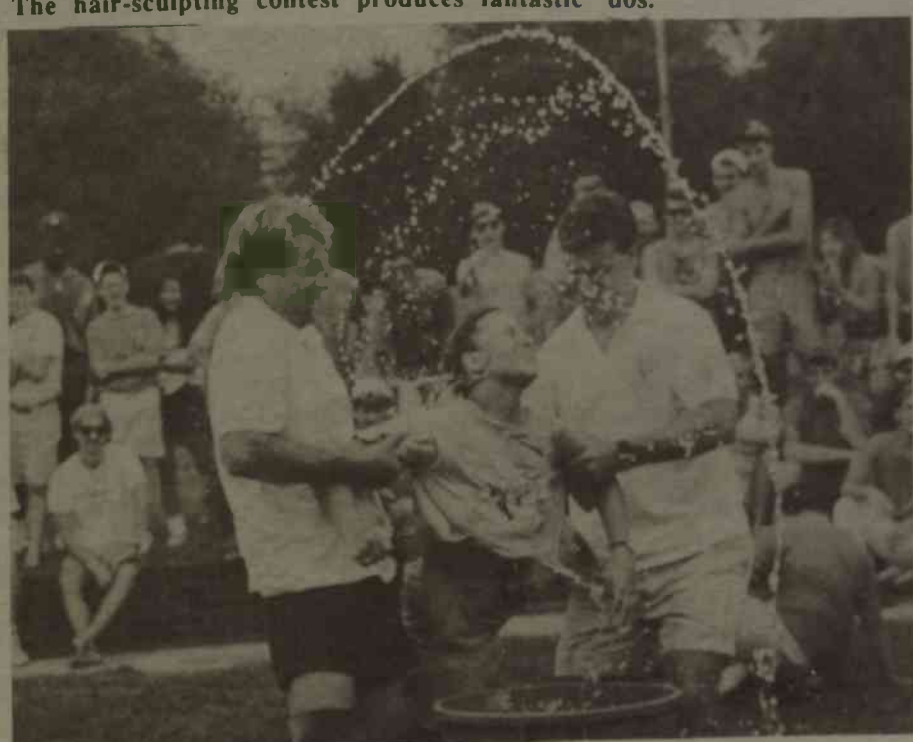
In the game of musical buckets, sometimes the dunkers get as wet as the "dunkees."