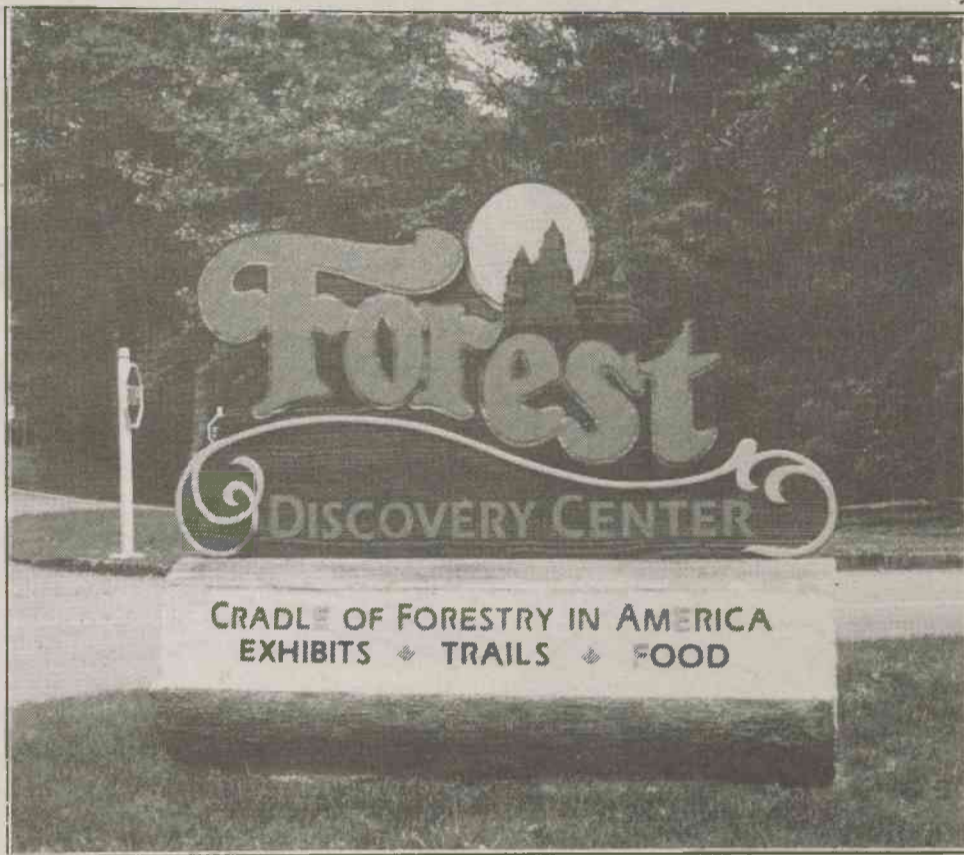
(Top) The Cradle of Forestry has been a popular attraction for many years. It has been enjoyed by many. (Bottom) Sliding Rock, formed by natural means, has awed many visitors.