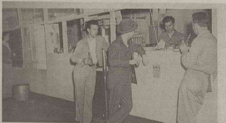
The Pertelote Archives

In 1950, scarcely 100 students attended this college with the average tuition cost at $500.00, compared to the average of $1,119 for private institutions. Then five years later, enrollment tripled to 320. Brevard College tuition and fees for 2001 will reach $18,000.