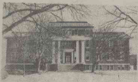
The Pertelote Archives

The 1950s were the years of pop culture and technical wonders: sock hops and television. Drive-in