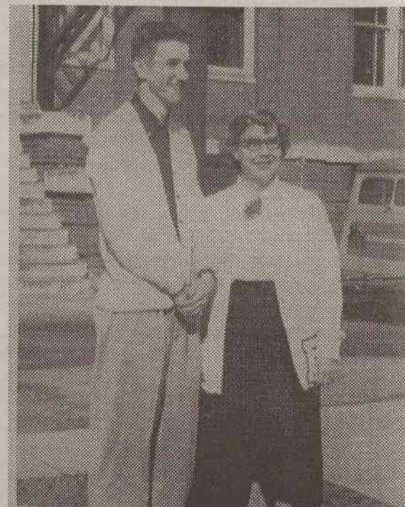
The Pertelote Archives

The 90's came and nothing but OJ Simpson splattered the TV. Who killed Jon Bennett Ramsey? And, is the President having an affair with Monica Lewinsky? Brevard Community College became a four year institution.