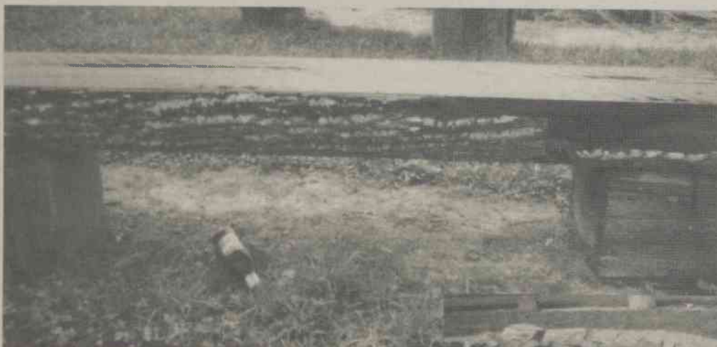
Alcohol in the Village