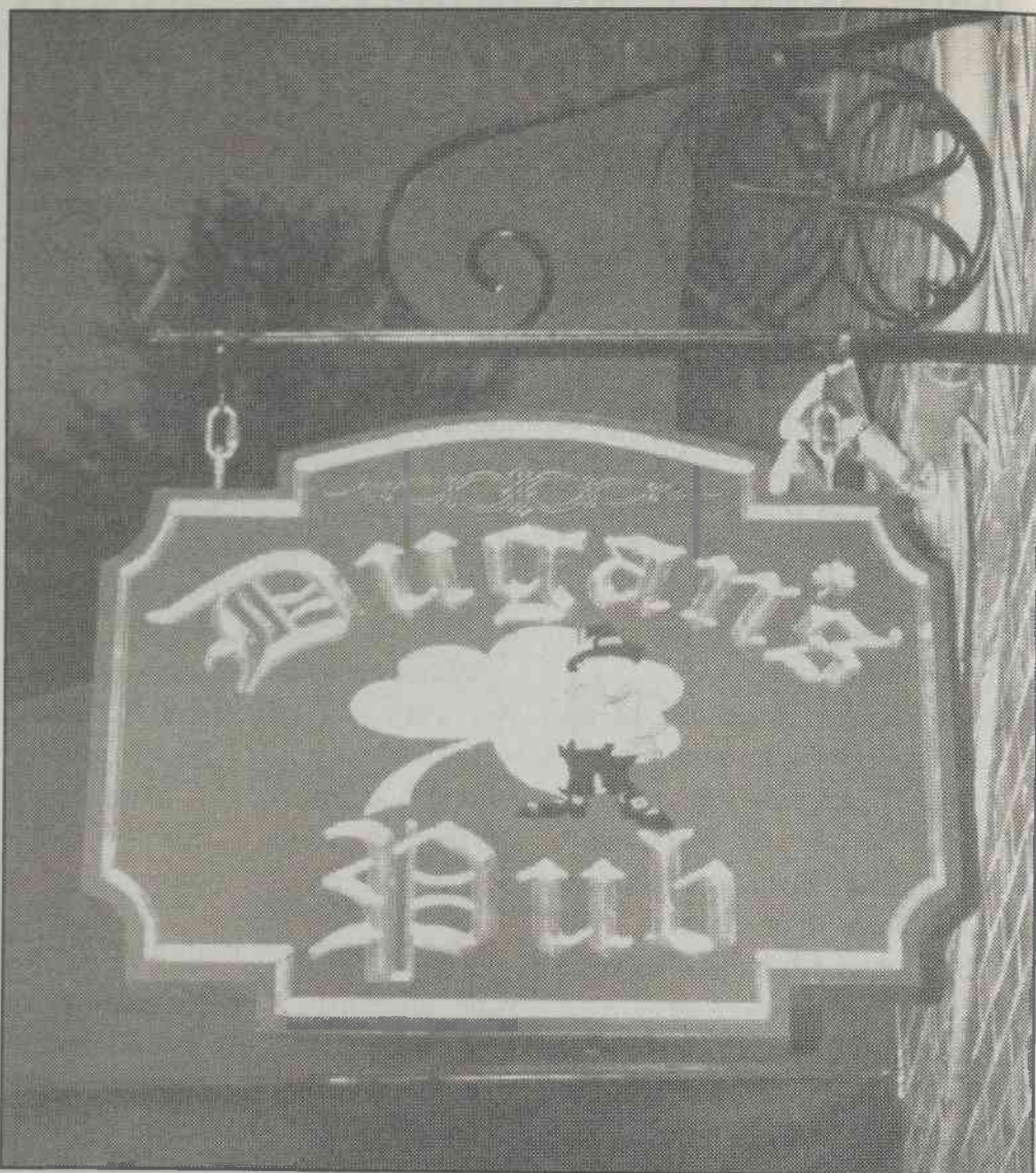
Dugan's Pub sign, downtown Brevard

Speaking of etiquette, if you want to find a place where there is none then this is your dive. This is a place where every ex-con, I mean, every-