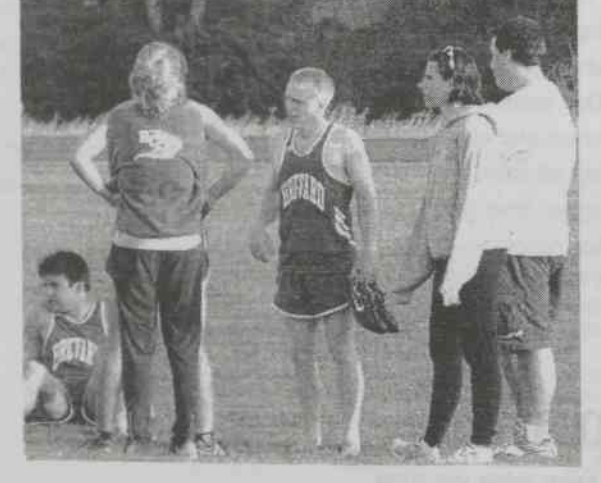
Members of the track and field team discuss Friday's meet

On the women's side, the meet was won by Bellarmine University. Cumberland College won the men's meet.