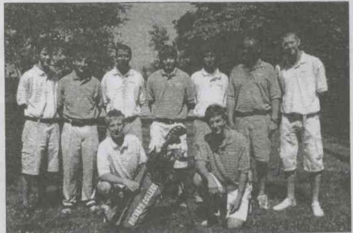
The BC golf team is now ranked 25 in the nation

With Thanksgiving just around the corner, I know what I'll be giving thanks for this year, and, baseball fans, I urge all of you to do the same.