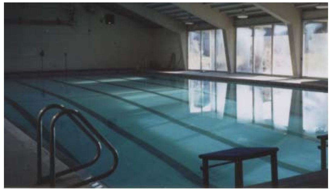
BC Pool once in operation

The next women's game will be Thursday February 1, 2007 at 6 p.m. It will be played here at BC against King College. The next men's game will be played February 5<sup>th</sup> at Newberry College. Tip-off time is set for 7 p.m. for this game.