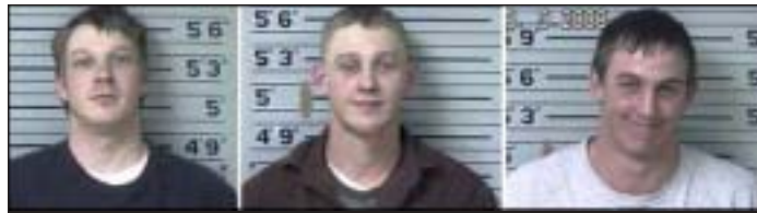
The mugshots of the three men arrested on the Brevard College campus last weekend. All three are banned from campus and students are urged to report to campus security any sightings of the men.

The release also stated that all three men have been issued no trespass letters and are banned from campus. Students seeing any of the three men are urged to report them to Campus Security immediately.