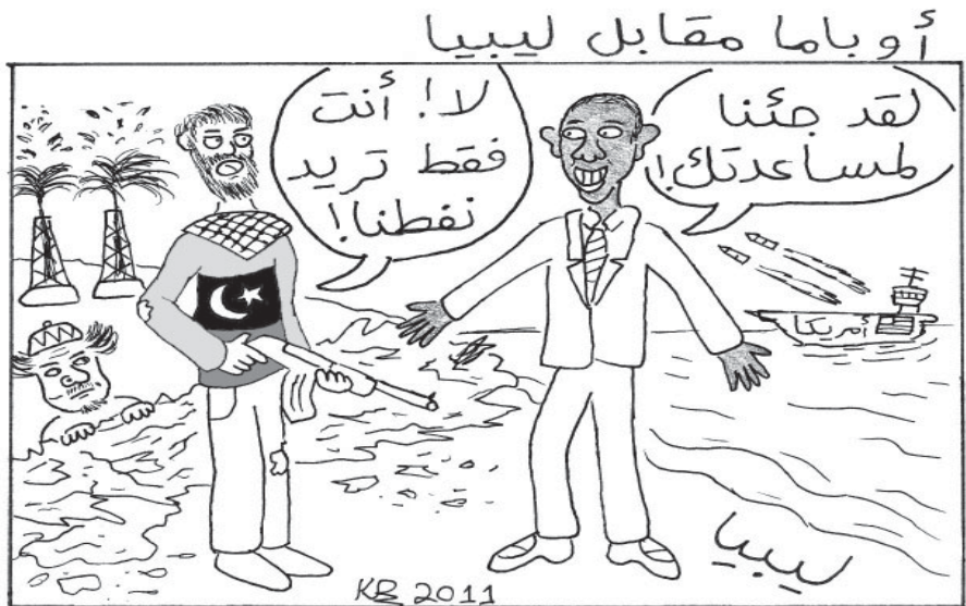
Cartoon by Karam Boeshaar

Artist's Note: From now on all comics will appear in Arabic. Please see page 9 for the translation.