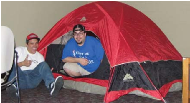
New South Village - pop. 2

Those interested in forming a tent city should contact Clarion staff at clarion@brevard.edu. Step in. Stand out.