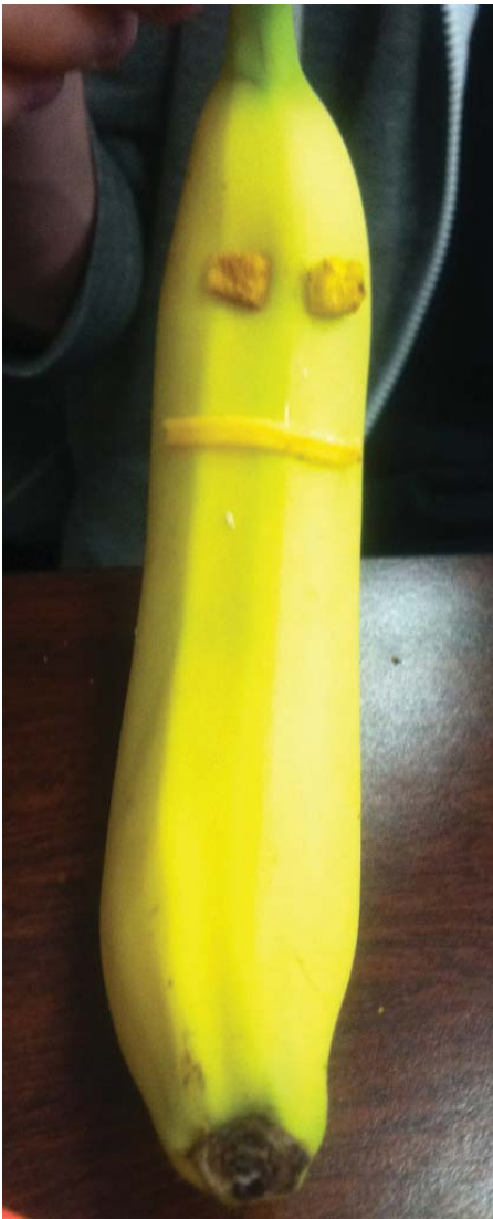
This week's Cafeteria Creation is Leon. It is alive. Send in your best creation to us at clarion@brevard.edu .