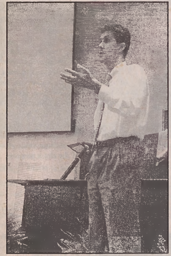
JARRETT BARRIOS MASS. STATE SENATOR